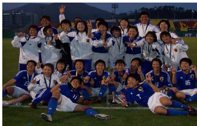
The U-16 women's national team

When, in 1995, today's FIFA President said "The future of football is feminine", it was more than mere lip service. It reflected a strong belief in the huge potential that women's football has to develop. Ever since, FIFA has given targeted support for the efforts of associations who offer women the same opportunities to develop as male players. Launched in 1998, FIFA's Financial Assistance Programme (FAP) introduced a requirement in 2004 for the associations and confederations to invest at least 4% of their FAP funding into women's football. This threshold was increased to 10% in 2005. On top of this commitment, FIFA also promotes the women's game in more general ways by directly financing women's matches and organising competitions and symposiums. Thanks to its development programmes, FIFA is also playing an active role in the training of administrators, coaches, referees and sports doctors.