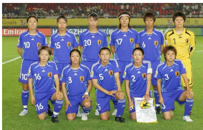
The Japan women's senior national team