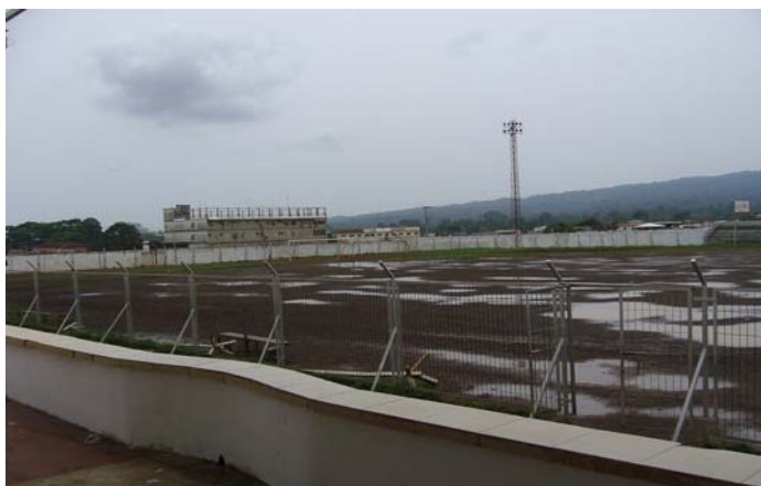
La Paz Stadium, Malabo

Further information on Win in Africa with Africa: http://www.fifa.com/mm/goalprojectWinAF_E.pdf